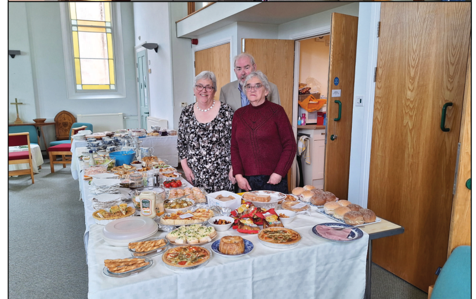
Part of the 20th Anniversary celebrations