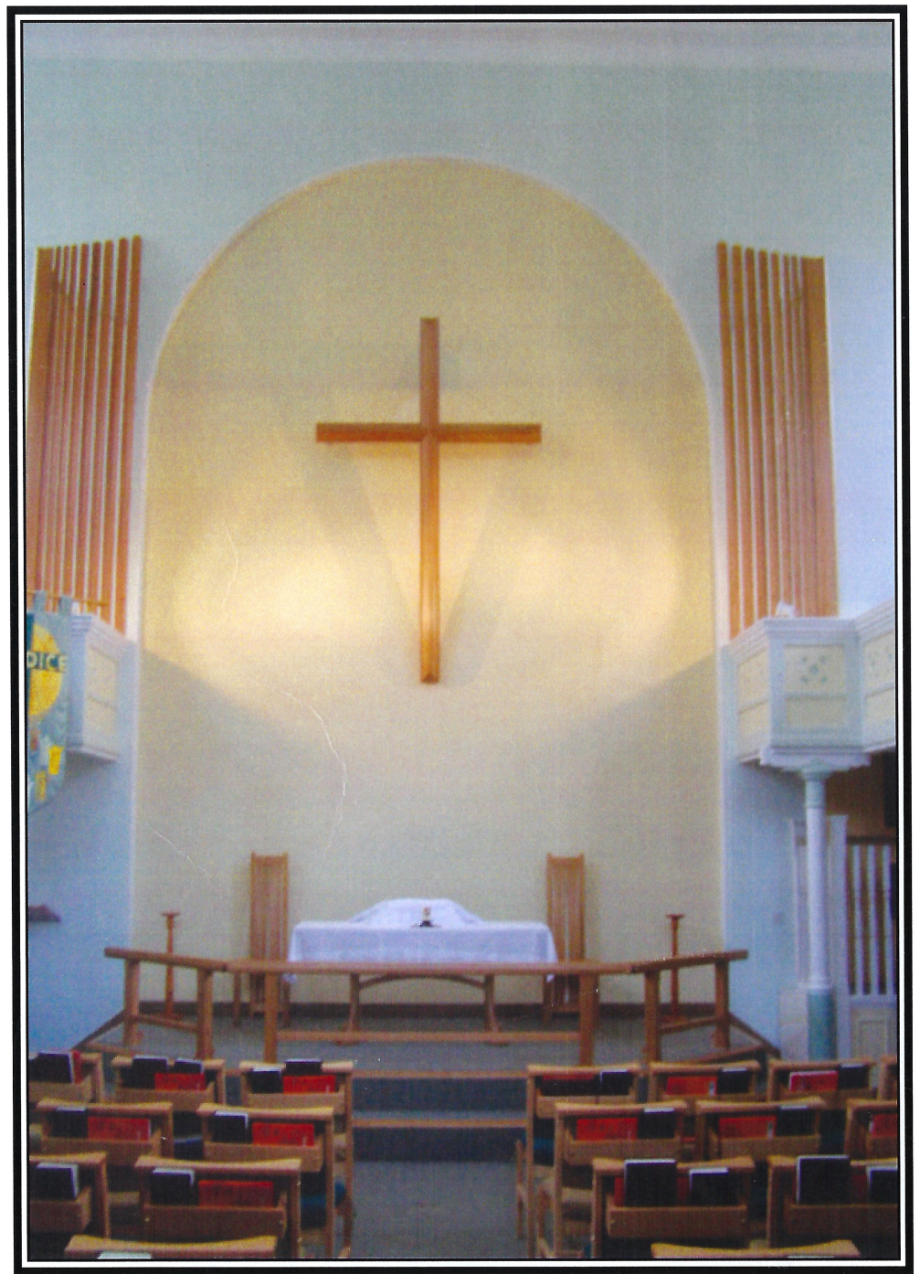
and the new.